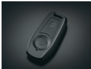
Key-Less Ignition System