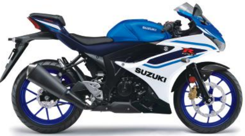
Metallic Triton Blue / Pearl Brilliant White (BQJ)