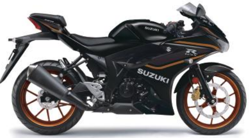
Titan Black (YVU)