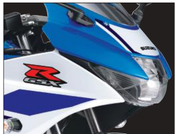
LED headlights and LED position lights