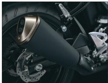
Dual-Exit Exhaust Muffler