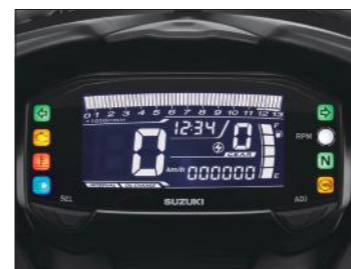
Multi-Function, Full LCD Instrument Cluster

GSX-S125 utilizes a fuel injection system with 6 sensors for optimal control under various road and weather conditions. This combines with a dual-spray, 4-hole injector