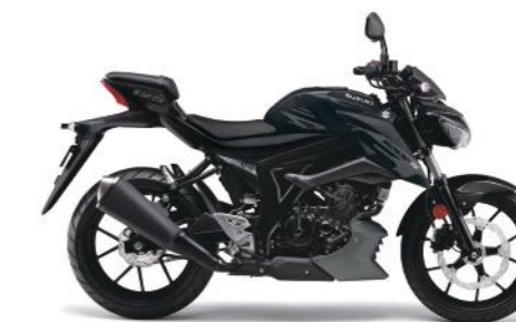
Titan Black (YVU)