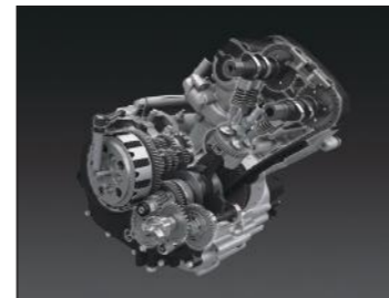
Science of Engine Design