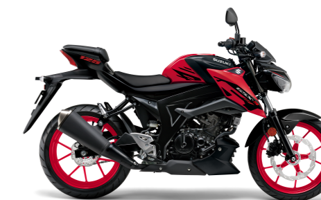
Stronger Red / Titan Black (GTA)